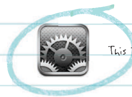
This is the Settings icon.